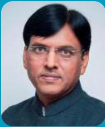
Dr Mansukh Mandaviya

Hon'ble Union Minister of Health & Family Welfare Chemicals & Fertilizers Government of India