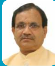
Shri Bhagwanth Khuba

Hon'ble Union Minister of Health & Family Welfare Chemicals & Fertilizers Government of India